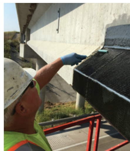
Clark County, MO Bridge Girder Repair