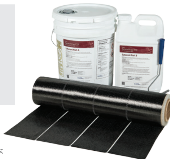
RenewWrap® FRP Strengthening System