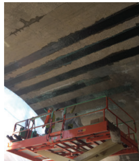
Indianola Avenue Arch Slab Bridge Repair in Columbus, OH

CFRPs are used for shear strengthening of a concrete girder, including those damaged by truck impacts due to low clearance. This type of repair increases flexure and shear strength to restore lost capacity or support higher loads. The U-wraps can also confine concrete repairs made to corrosion-damaged girder ends or girders hit by trucks. Each state has its own standard details for CFRP girder repairs. Some wrap just the bottom flange of the girder while others wrap the complete height of the girder. Some require one layer with the fiber aligned vertically on the sides while others require two layers — one aligned vertically and one aligned horizontally. A standard detail for confining concrete repairs with FRPs is likely to emerge in the coming years as more DOTs employ this technique.