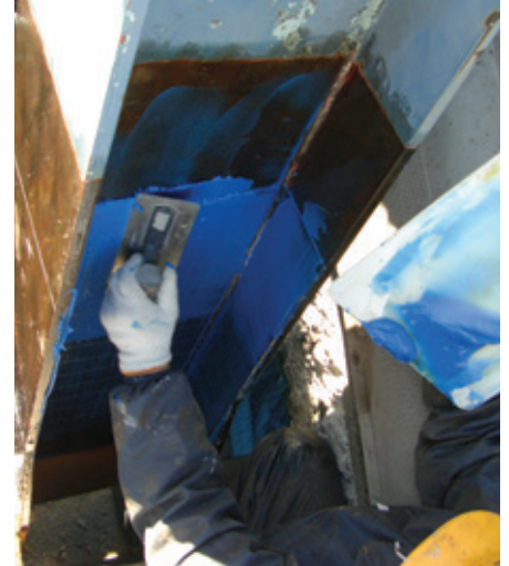
Steel bridge strengthening using carbon fiber strands sheets

The rehabilitation of the 1,090-foot-long Honjo Truss Bridge was one of the first strand sheet applications to a steel structure. This steel truss superstructure was weakened from the corrosion of truss members — where the diagonal members penetrated the concrete deck — and the sufficient section loss required strengthening. The deck was removed around the truss members and the carbon strand sheets bonded to the webs and flanges of the W-beams comprising the diagonal members. Thirty-six diagonal members were strengthened with strand sheets, and the area of the bridge was painted after the sheets were finished curing.