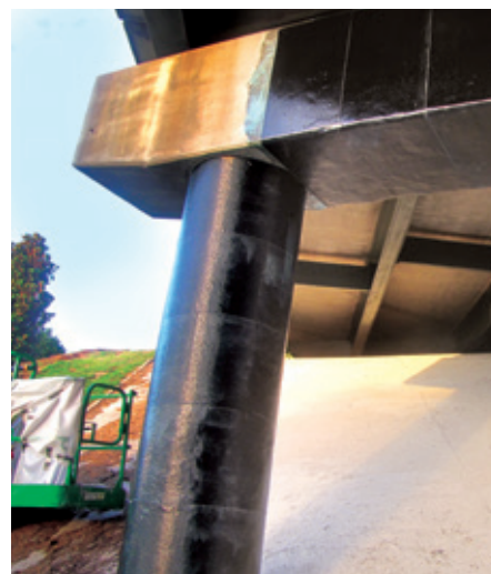
Greenville County, SC Pier Cap and Column Repair