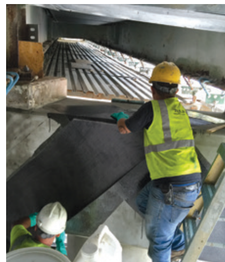
Garrett County, MD bridge Pier Cap Repair

Once the FRP cures, an epoxy or latex acrylic top coat can be applied for aesthetic reasons and UV protection. Compared to encasing the existing columns in reinforced concrete or installing and welding steel jackets followed by grouting, it is not hard to see how FRPs offer cost benefits.